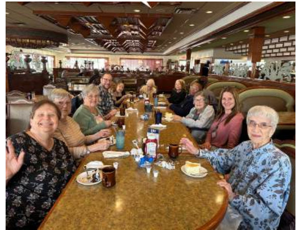
The Forum Outing