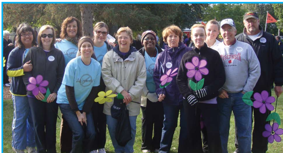
The Lutheran Home and Harwood Place team raised $1,700 for the walk